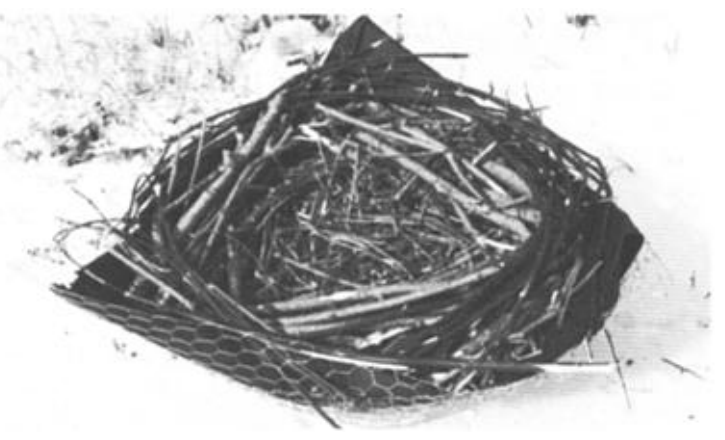
Figure 3. View of artificial nest from above showing nest material.