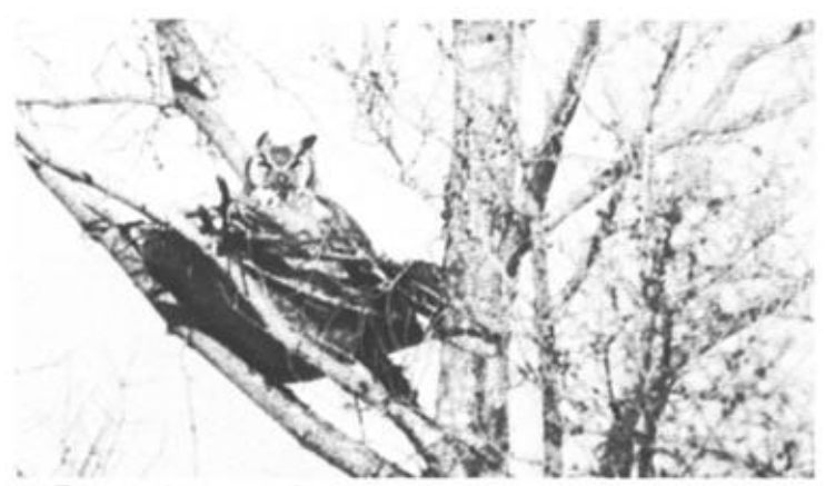
Figure 1. Great Horned Owl in artificial nest in central Minnesota.