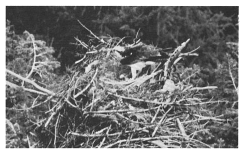
Figure 2. Incubating Osprey standing at nest edge as helicopter approaches.