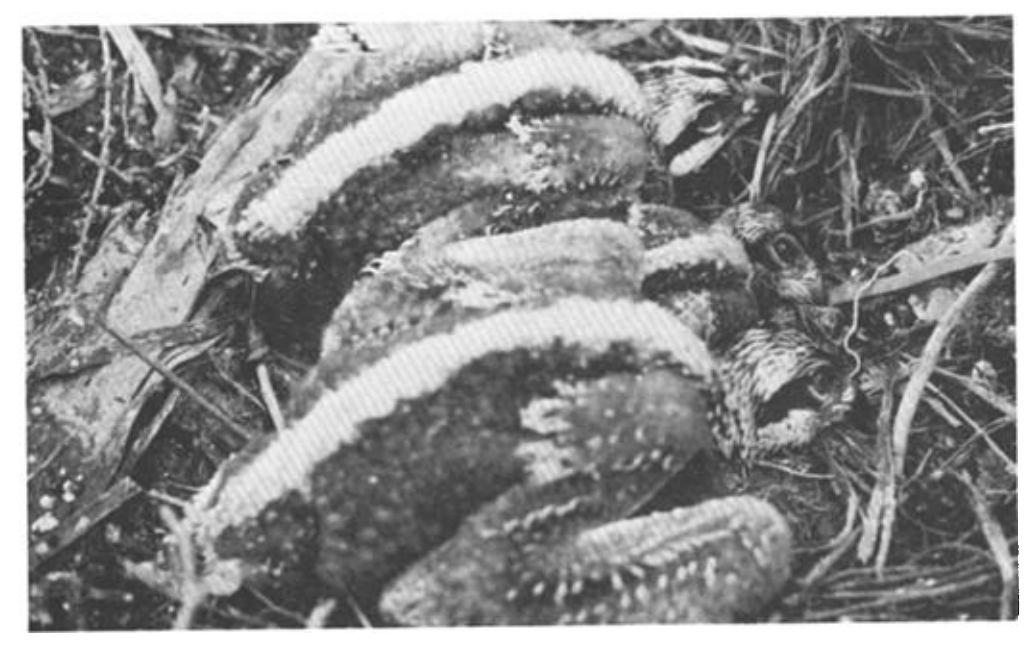
Figure 4. Opsrey nestlings showing white vertebral stripe.