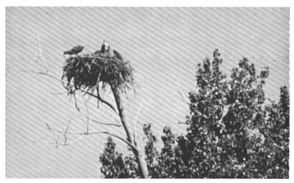
Figure 1. Osprey nest in cottonwood snag on St. Joe River, Idaho.