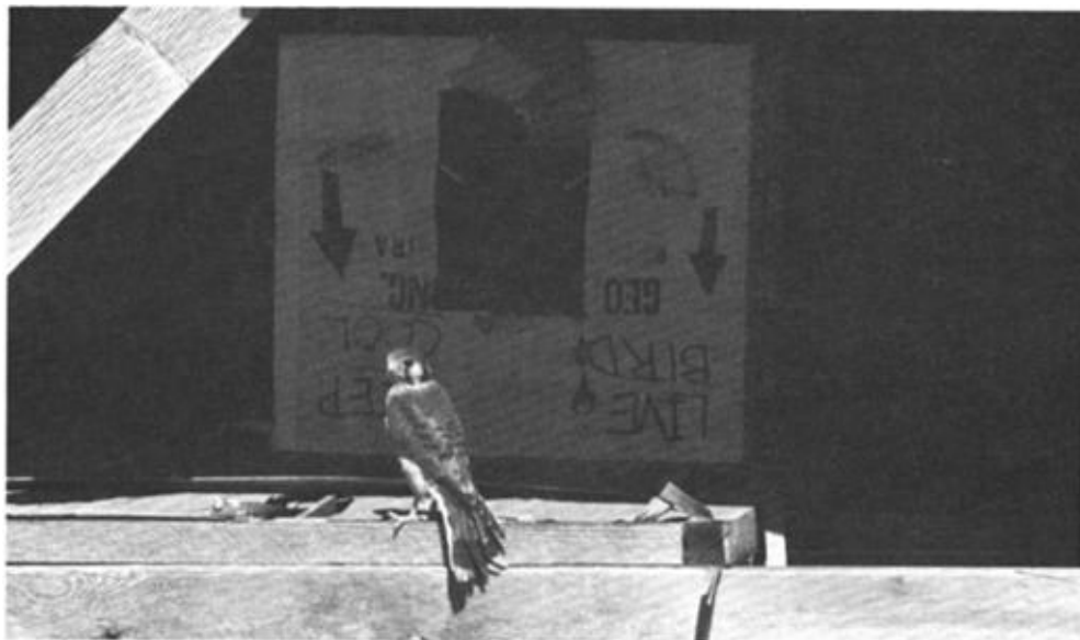
Figure 1. A hack box for American Kestrels ( Falco sparverius ) can be made from a cardboard box. This one was placed in the rafters of a shed.