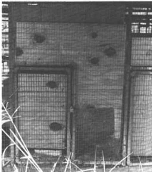
Figure 4. Wire cage, with inner plywood and burlap lining, used to house raptors during recuperation. The two-meter height of these enclosures affords some exercise when a bird jumps to perch near the top.