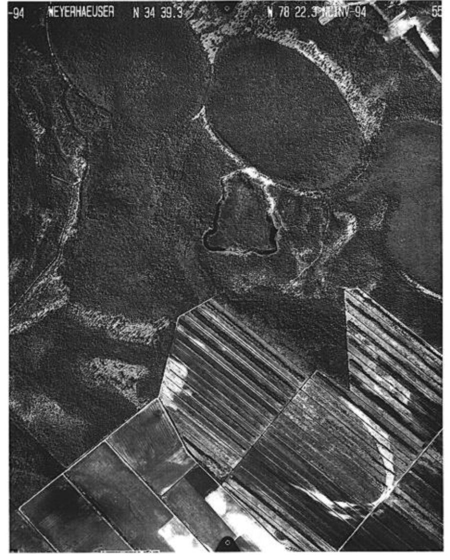
FIGURE 1. Aerial view of three Carolina bays (ovals at top) in Bladen County, North Carolina. The middle bay was among those sampled in this study (Floodgate Bay). Note partial view of a water-filled bay on the left margin of the photo and, in the field at lower right, the sandy southeastern rim of an obliterated bay.