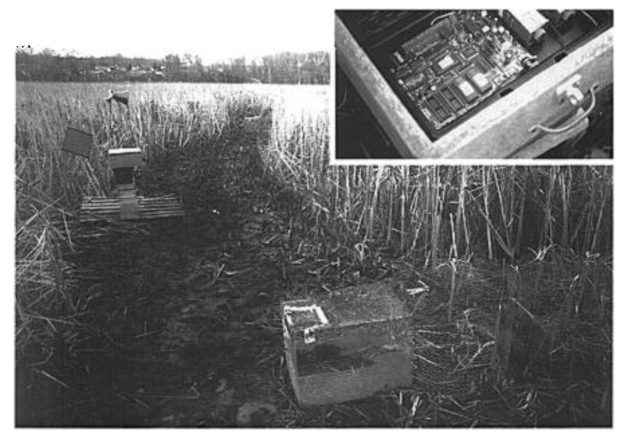
FIGURE 1. Winter photo of trap line in tidal marsh showing walk-in traps with drift fencing running between the traps (top and bottom center), and sound system with solar panel and speaker (upper left). (inset) Digital playback equipment including amplifier, micro-chip message repeaters (near center) and timing units (upper right) in weather-proof housing.

circuit to provide programmable turn-on capability for the following day. All electronics, including amplifier and timing circuits, were packaged together in a weather-proof unit (Fig. 1). We used 15 watt, 8 ohm outdoor speakers and power was provided by a 12 vdc, 60 amp deep cycle wet cell battery charged by a 14 watt solar panel. Cost of each completed sound unit was about U.S. $700.