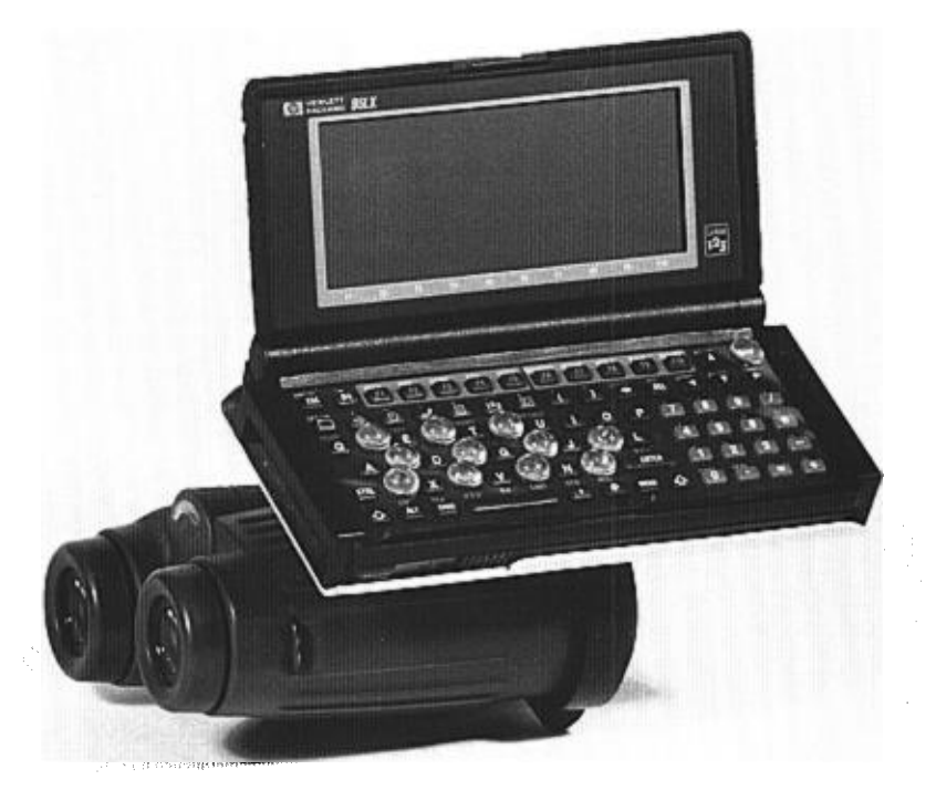
FIGURE 1. Palmtop computer on mounting bracket affixed to a pair of Leica 10 \times 42 Ultra binoculars.

store programs and data as a backup or archive. Battery life of the RAM cards typically exceeds a year.