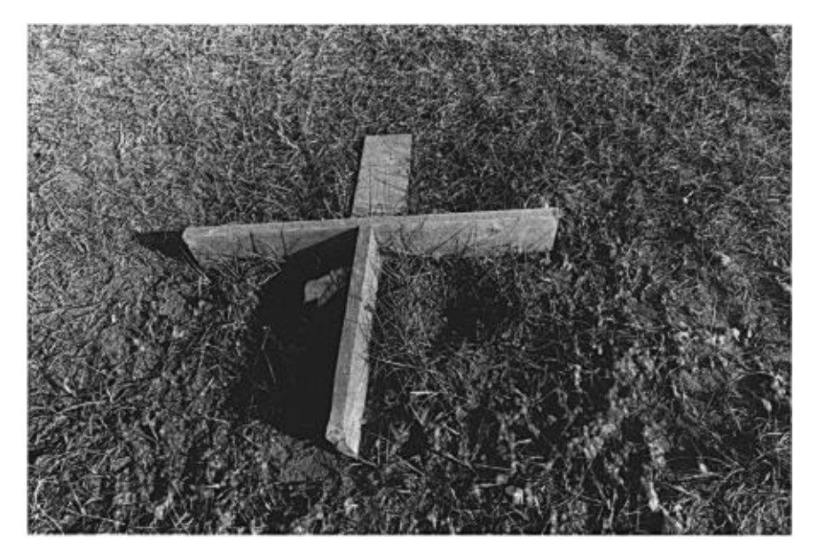
FIGURE 1. Common Eider nest structure on Seahorse Island showing nest depressions. Only two nesting quadrants are present due to collapse of one of the walls.

on the islands, due to the distance from treeline and the limited ice-free period (approximately 4 mo) when driftwood is deposited. Additionally, storm surges remove driftwood from low lying islands.