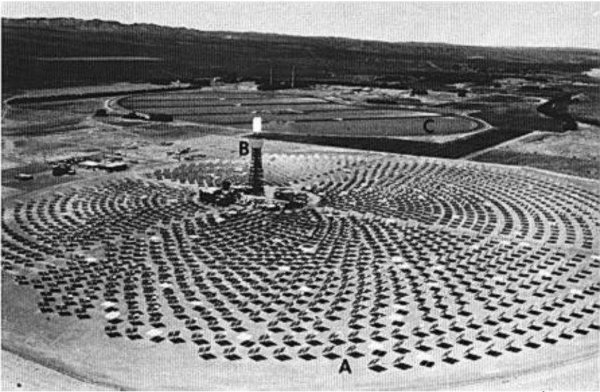
FIGURE 1. Aerial view of Solar One: (A) heliostat field, (B) central receiver tower, (C) evaporation ponds. Tower height = 86 m, diameter of field = 765 m.

To determine the impact of bird mortality on local populations, 1–2 observers conducted surveys of relative avian abundance within an area of approximately 150 ha surrounding Solar One, concentrating on the facility grounds (32 ha), evaporation ponds, and agricultural fields. These surveys were conducted on at least 2 d per visit for 3–4 h/d.