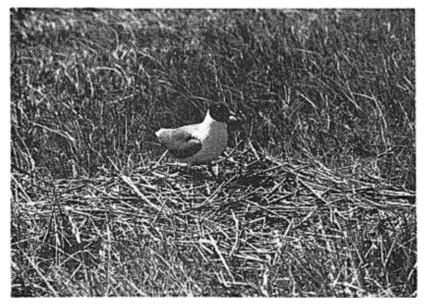
FIGURE 1. Laughing Gull holding an eggshell in its beak. The bird may simply drop the shell over the nest rim, walk with the shell from the nest, or fly off with the shell.

nest cup. Of the eggshells in the nest cup many belonged to newly hatched chicks and would probably have been removed eventually. One hundred forty-five (50%) of the shells were found out of the nest within 2 m of the nest rim; 87 (30%) of the shells were within 25 cm of the nest rim. About 9% (25 shells) were between 2 and 4 m from the rim, whereas 43% (127) were missing (not found within 4 m of the nest). Of the 102 eggshell removals observed from a hide, 51% (52) involved a gull flying with the shell away from the nest. Approximately 26% (26) of the shells were picked up by gulls that walked from the nest before dropping the shell; 24% (24) of the eggshells were picked up and simply dropped over the nest rim (Fig. 1). Observations on identifiable individuals and pairs revealed that some birds repeatedly flew off with eggshells, whereas others consistently walked with or dropped shells from the nest.