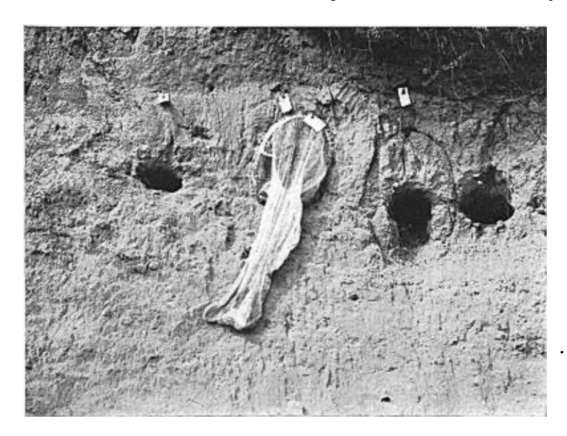
Fig. 1. A gauze net placed over the mouth of the Bank Swallow burrow will capture the occupant as it emerges. The circle around the burrow entrance to the right indicates that a return was taken from this burrow. June, 1940. Albany, New York.

Nos. H-94148 and H-94149, immatures; banded 10.20 A.M. June 29, 1933, from a burrow in a sand pit ten miles west of Albany