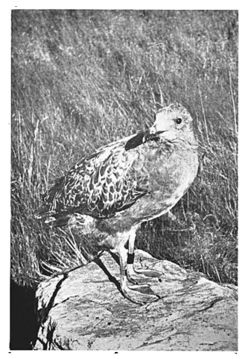
Immature Herring Gull banded August 9, 1940 with B. S. band on the right leg and two black bands on the left leg.