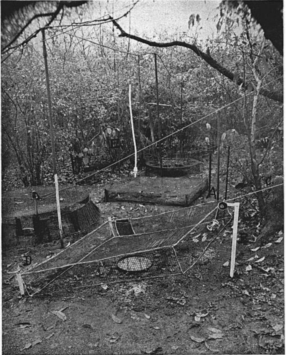
PHOTOGRAPH No. 1