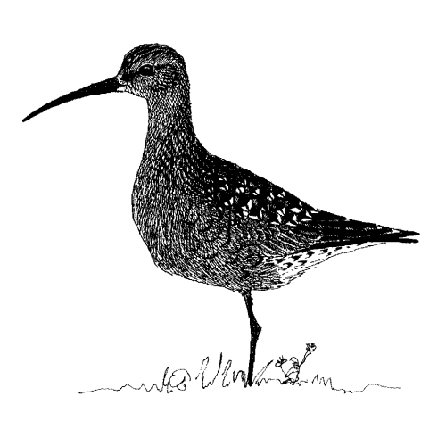
Curlew Sandpiper