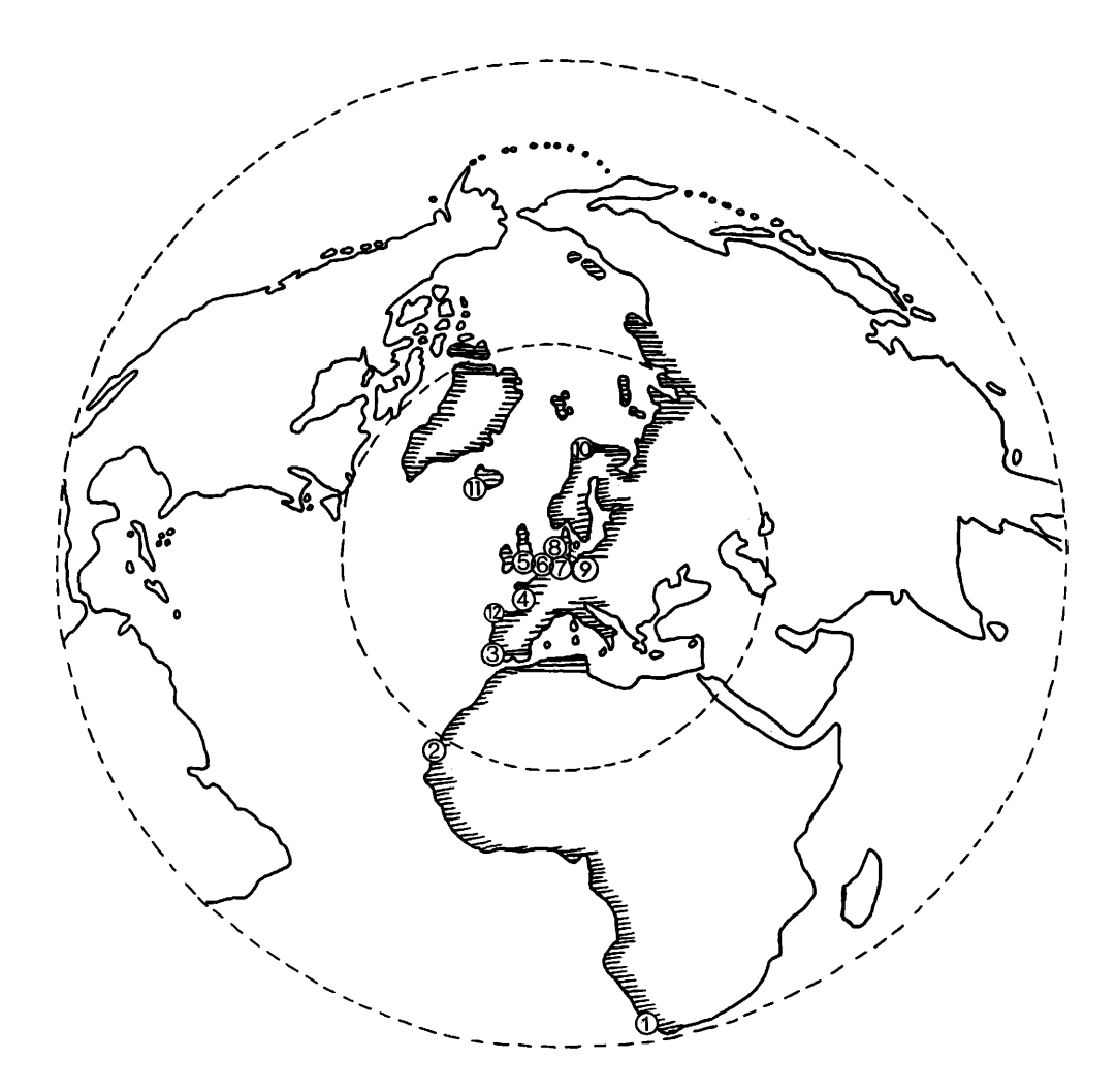
Figure 1. Coastal sites along the East Atlantic Flyway (shown shaded) at which intensive wader migration studies are under way during spring 1985. Numbers refer to those in the text.