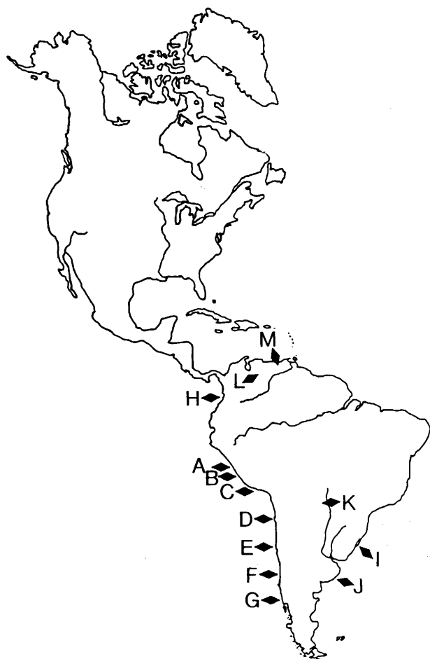
Figure 1. Map of the western hemisphere, showing the location of banding activities in South America (see Tables 1 and 4). Locations are Peru: A Villa, B Paracas, C Mejia. Chile: D Mejillones and Antofagasta, E Coquimbo, F Longotoma/Papudo, G Valdivia. Colombia: H Buenaventura. Brazil: I Lagoa do Peixe. Argentina: J south-eastern Buenos Aires Province. Paraguay: K eastern Chaco. Venezuela: L Calabozo, M north-eastern lagoons.

1 A = Villa, B = Paracas, C = Mejia, D = Hornitos/Mejillones, E = Coquimbo, F = Longotoma/Papudo, G = Valdivia. 2 Month-year