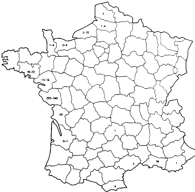
Figure 6. Breeding distribution of Redshank in France (from Dubois & Mahéo 1986)

son is possibly a reason for the high mortality of young Redshanks.