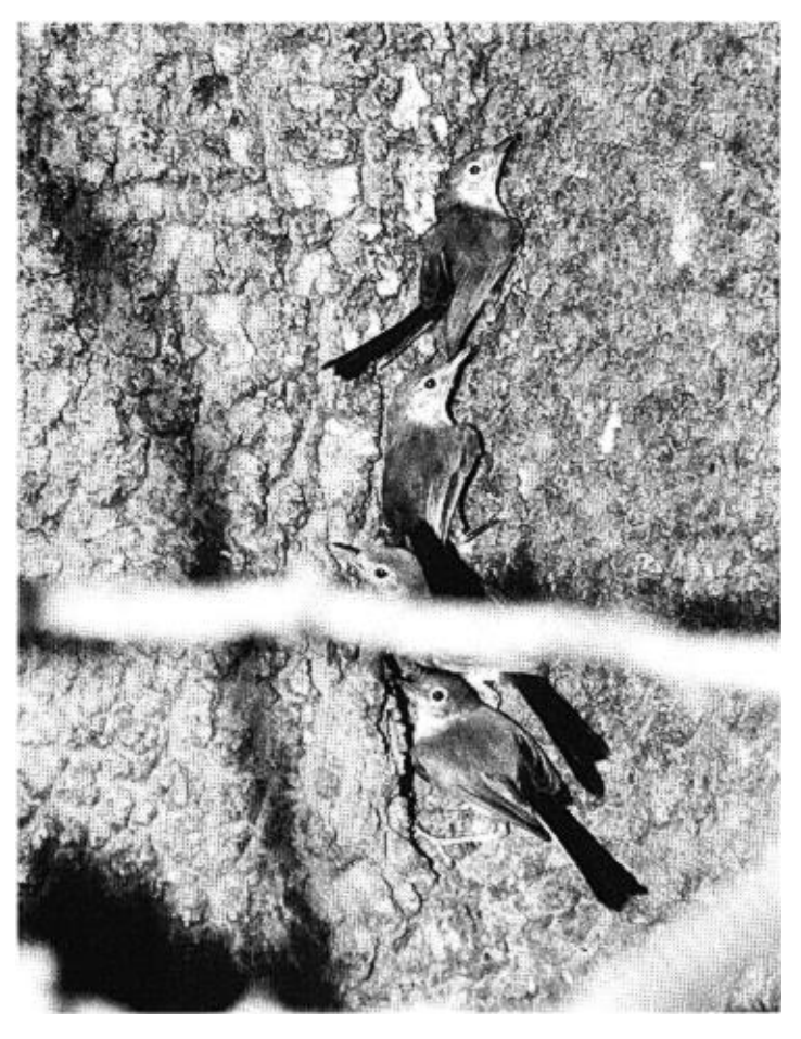
FIGURE 1. Black-tailed Gnatcatchers sitting at the base of a large paloverde tree (site 1) during the hottest part of the afternoon on 1 August 1995. Data showing the thermal advantages of this specific site are presented in Table 1.

bur-sage (Franseria deltoidea), producing deep shade beneath the tree. This site was occupied by from two to eight Black-tailed Gnatcatchers on two the consecutive afternoons, as well as when we visited the site the following week. On 1 August, between 16:00 and 17: 00, two to six adult and juvenile Black-tailed Gnatcatchers were observed occupying the site 1 at different times (Fig. 1). These birds arrayed themselves in a line along the crevice created by the intersection of the two subsidiary trunks. The gnatcatchers sat with their wings held away from their axillary region and rested against the trunk surface. None of the birds were observed panting. Activity included occasional movements to other nearby sites, including the sand at the tree's base, and infrequent postural adjustments. During these observations, we were often within 2 m of the site and although our movements initially flushed the birds from the site they immediately returned to the crevice when we stopped moving. This behavior occurred at least six times during one of our visits. These birds may or may not have represented a family group, but the be-