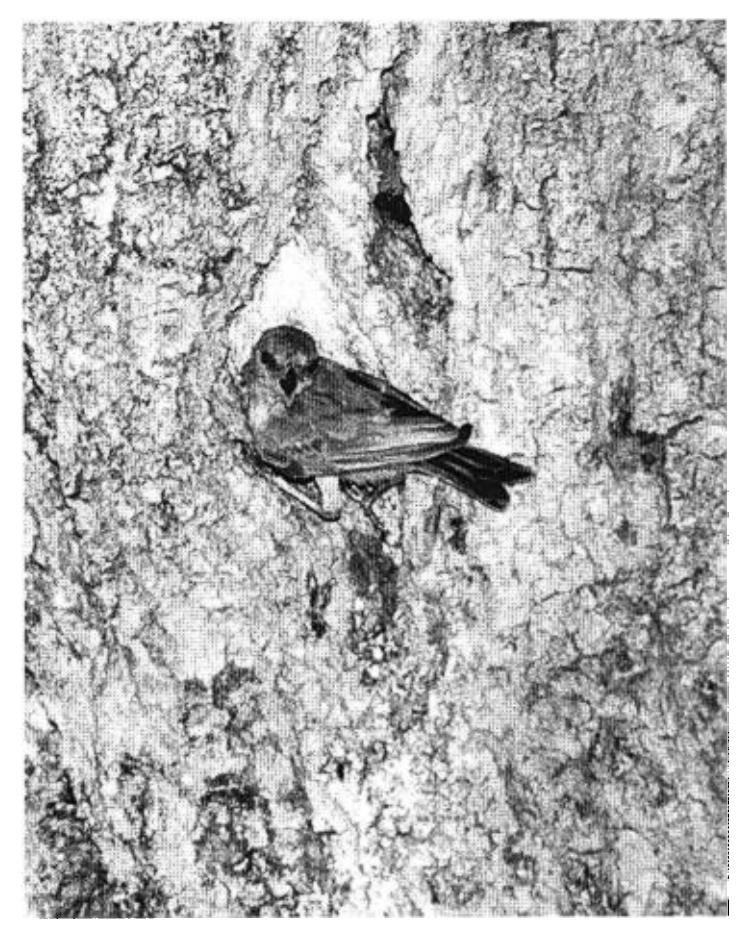
FIGURE 2. Juvenile Verdin resting in a knothole 1 m above the ground on the north side of a large paloverde tree (site 2) during the hottest part of the afternoon on 1 August 1995. The air and substrate temperatures of the microsite and nearby shade air temperatures are presented in Table 1.

against the trunk of the tree for 96% of the total time it was under observation (Fig. 2). The bird panted intermittently and occasionally closed its eyes, but otherwise sat motionless. The remaining time was characterized by an occasional brief foray into the canopy or to an adjacent tree where foraging or flying occupied 3% and 1%, respectively of the total observation time.