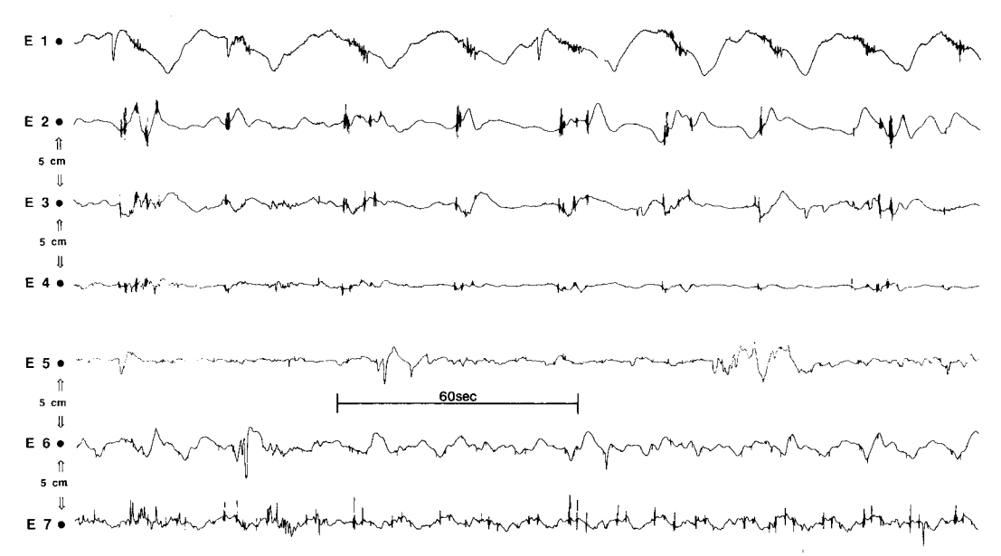
FIGURE 1. Fed-state myoelectric activity in a male chicken. Electrode 1 is on the thick muscle of the stomach; E2–E4 are 5 cm apart on the duodenum, with E3 at the duodenal flexure; E5–E7 are 5 cm apart on the proximal ileum. Note the slow-wave activity, particularly in the stomach, the clusters of duodenal spiking coordinated with gastric activity, and the random spiking of the ileum. Reproduced with permission from The American Physiological Society (Clench and Mathias 1992a).

ratory (Clench et al. 1989). The seven smaller roosters were implanted with four electrodes and the eight largest were given seven. The electrodes were sutured to the intestinal serosa in several different locations: two to seven electrodes were placed 2.5, 5, or 10 cm apart on the ileum of all chickens. (Because there is no morphological basis in birds for differentiating the small intestine distal to the duodenum as "jejunum" and "ileum," we use the term "ileum" for that entire length of intestine.) The spacing and placement of the electrodes was determined by the length of each bird's ileum and the particular motility characteristic being studied. In three of the roosters, one electrode was implanted on the thick cranioventral muscle of the stomach and three more were placed 4 or 5 cm apart on the duodenum. In related studies, some of the four electrodes were sutured on the ceca and the rest on the ileum; the ileal record of those birds is reported here. The pheasants were implanted with four electrodes spaced 5 cm apart on the proximal ileum and the owls received four electrodes 2.5 cm apart in the same area.