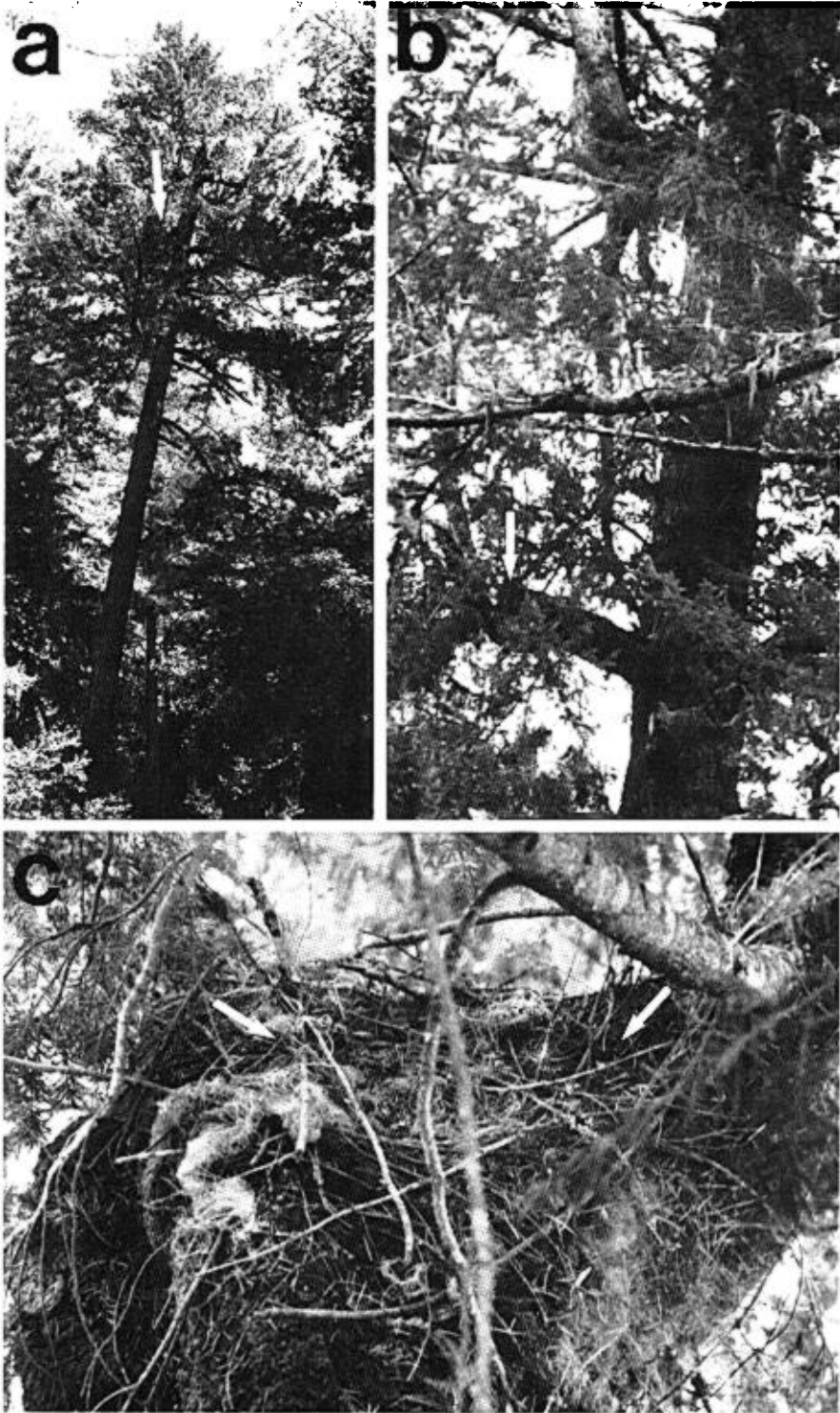
FIGURE 1. The Opal Creek nest. a. Nest tree with arrow showing nest location. b. Close-up of nest branch with arrow showing nest location. c. The constructed nest as viewed from the trunk looking along the branch to the natural platform. Arrows indicate outside edges of the nest.