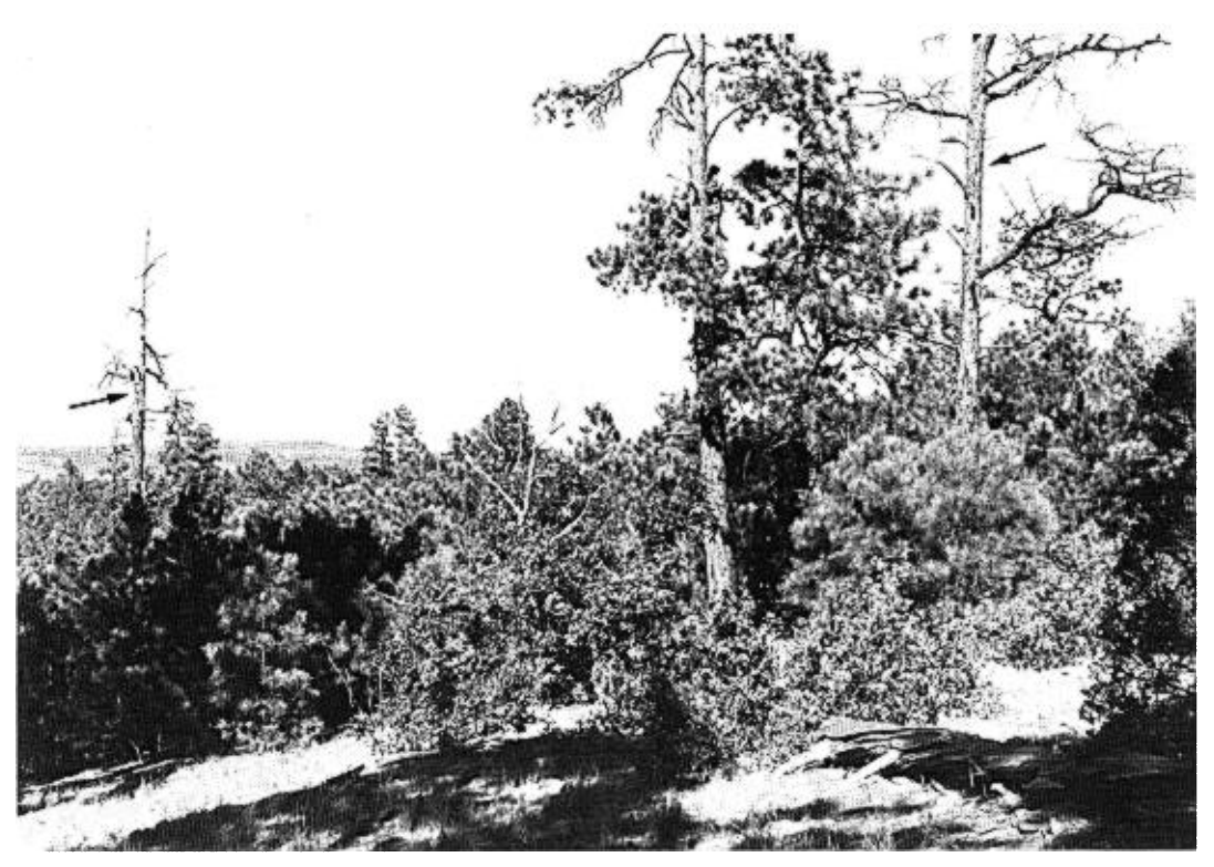
FIGURE 3. Nearest available unused (left) and used (right) nest sites of Flammulated Owls on a north-facing slope at 2,277 m in the Zuni Mountains, New Mexico. Cavities indicated by arrows are 8.2 and 6.7 m above ground, respectively, in ponderosa pines. Note the vegetation gradient from dense, shrubby ponderosas around the unused site (5,270 stems/ha) to a more open shrub stratum on the right, particularly in front of the used site (396 stems/ha in contrast to 927 stems/ha behind this tree).

ators is unlikely. Among potential competitors for cavities (i.e., those larger than bluebirds, see Methods), Hairy Woodpeckers do not reuse old cavities (pers. observ.), and American Kestrels ( Falco sparverius ) are too rare to have a major effect. Only Abert's squirrels and Northern Flickers have occupied cavities previously used by the owls, and are large enough to restrict their options. Their impact is a matter deserving further study.