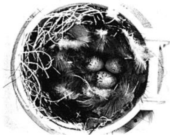
FIGURE 1. The composition of the nest reflects a female Canary's preference for coarse and fine building materials. Initially, she selects coarse materials (shredded wood and hair) and later, she uses feathers.

The Canaries that built nests in this and the other experiments reported in this paper developed brood patches and displayed the normal sequence of nest-building activities described by Hinde (1958). A representative sequence is presented in Figures 2 and 3.