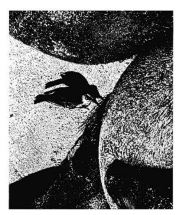
FIGURE 1. Hood Island Mockingbird pecking at the mouth of a sleeping sea lion.

Department of Zoology and Entomology, Colorado State University, Fort Collins, Colorado 80523. Accepted for publication 23 October, 1975.