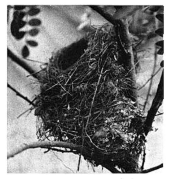
FIGURE 1. Amakihi nest on top of Elepaio nest.

447-470, 1951) reported this in other passerines. It is also possible that the unusual nesting situation may have disturbed the Amakihi, causing desertion.