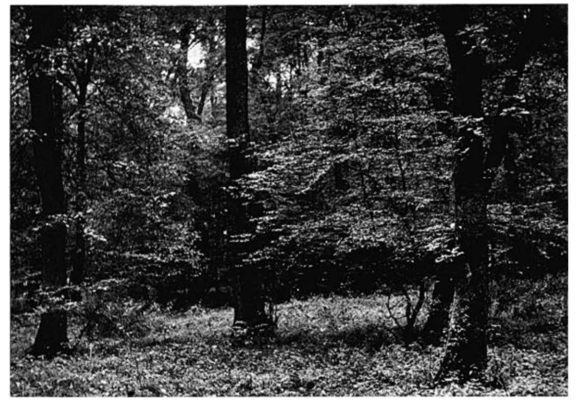
FIGURE 1. Oak-hornbeam forest stand in the Niepołomice Forest.

does not account for nomadic individuals that do not take part in reproduction. Therefore, the results obtained by this method probably underestimate slightly the actual avian biomass.