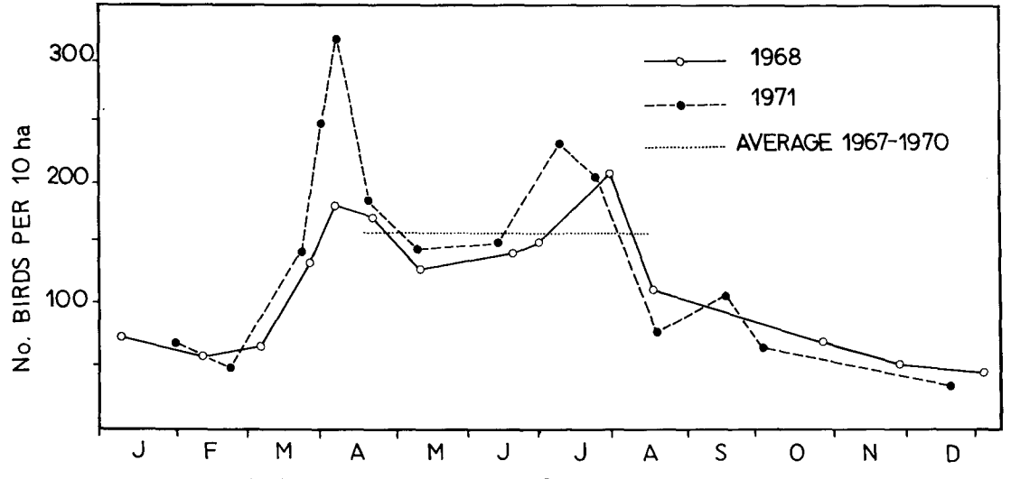
FIGURE 3. Numbers of birds/10 ha in the forest studied over a year.

was added to the values for respiration of adult birds in April, 55% in May, and the remaining 30% in June.