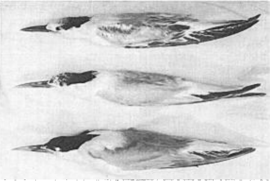
FIGURE 1. Dorsal (left) and side (right) views of three skins of Cayenne Terns collected in Uruguay. Lower: male in nuptial dress (September, skin No. 764); middle: a male in early stage of postnuptial or postbreeding molt (January, No. 650), and upper: a juvenile male in juvenal plumage (February, No. 620). See table 1 and the text for more details.

are white, heavily blotched with old black feathers; on the occiput some feathers have narrow white-edged ends; tails are worn but the central rectrices are new and growing; primary 8 (counting proximally from the outermost) is shed in No. 650, and 6 and 7 are obviously worn in both specimens. Males 598 and 621 (February and March) are in more advanced stages of progressing postnuptial molt with worn, shed, and new feathers among their primaries and rectrices.