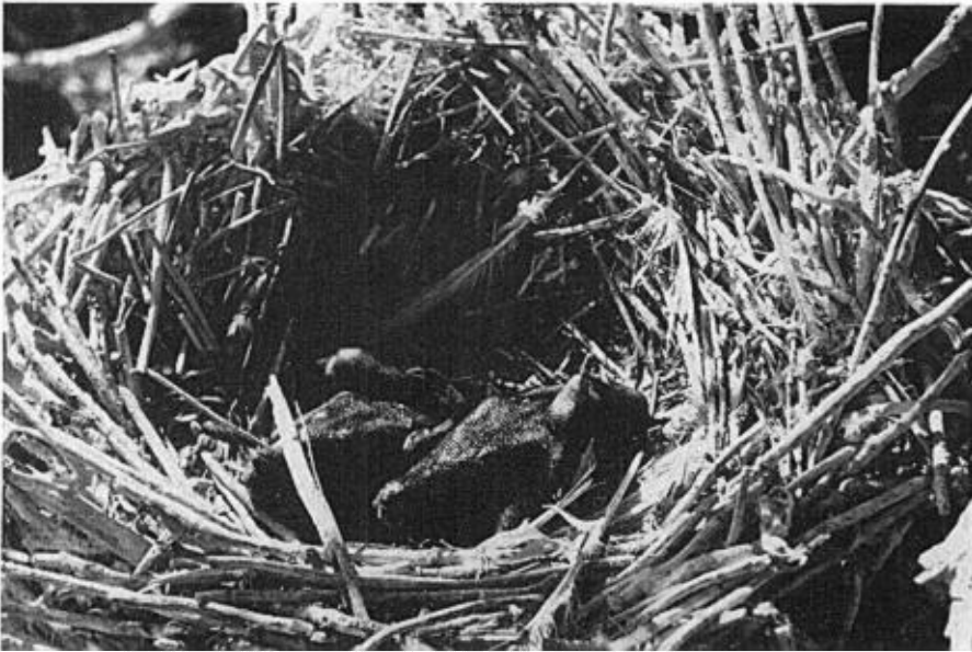
Fig. 2. Advanced downy cormorant young in the Lake Louise colony, 1958.

Aleutians, the Alaska Peninsula (Lake Iliamna), Kodiak Island, and the Kenai Peninsula (A.O.U., Check-list of North American Birds, 5th ed., 1957:35-36). The Lake Louise colony extends this range approximately 250 to 300 miles in a northeasterly direction from the Kachemak Bay area of the Kenai Peninsula, where the species is common. The relatively large size of Lake Louise, 52 square kilometers of surface, and the interconnected lakes Susitna and Tyone, together with their abundant fish fauna, apparently make this interior Alaska situation suitable for this small colony of cormorants. —FRANCIS S. L. WILLIAMSON and LEONARD J. PEYTON, Arctic Health Research Center, Anchorage, Alaska, September 23, 1958.