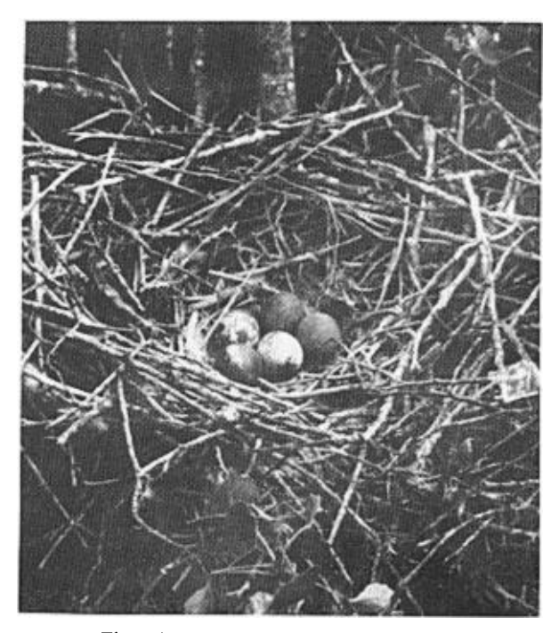
Fig. 3. Nest and eggs of White-tailed Kite.

Moore and Barr (1941) have described the plumage of the young kite. We have observed that when the young birds leave the nest (fig. 4) they are quite different in