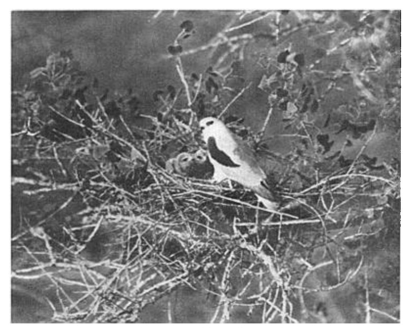
Fig. 4. White-tailed Kite at nest with small young in cottonwood tree.

Of the broods banded, 15 were located in cottonwood trees, five in live oak, two in orange trees, and one in a black willow. To date we have received only three returns of bands. They are as follows: one young kite, banded on May 16, 1943, was found dead on January 26, 1944, about 12 miles east of the point of banding; one banded on May 4, 1944, was found dead under the nest tree on May 30, 1944; and one banded on April 28, 1946, was killed on November 11, 1948, about 100 miles north of the point of banding.