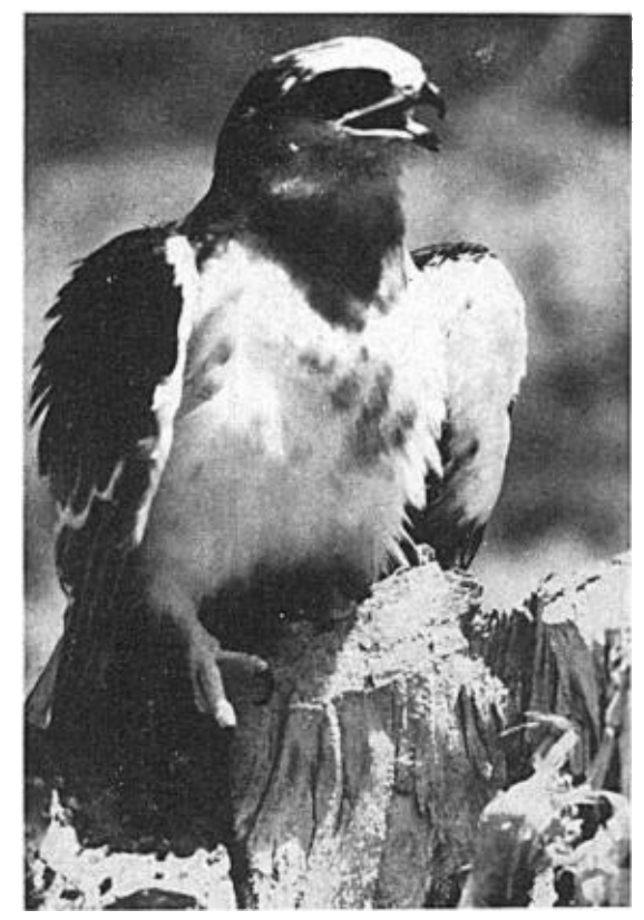
Fig. 5. Young White-tailed Kite just out of nest.

needle grass ( Bromus rigidus ). Here the grass had accumulated over the seasons until a mulch several inches deep had covered the area. In this place we also noted a female coyote ( Canis latrans ) lying flat on her stomach with one paw raised. Soon there was a wriggling in the dry grass in front of her and she brought her paw down quickly but firmly and reached under it with her nose and withdrew a meadow mouse. This locality contained the greatest concentration of meadow mice we observed. The surrounding area was somewhat overgrazed and this no doubt had forced the mice into this area.