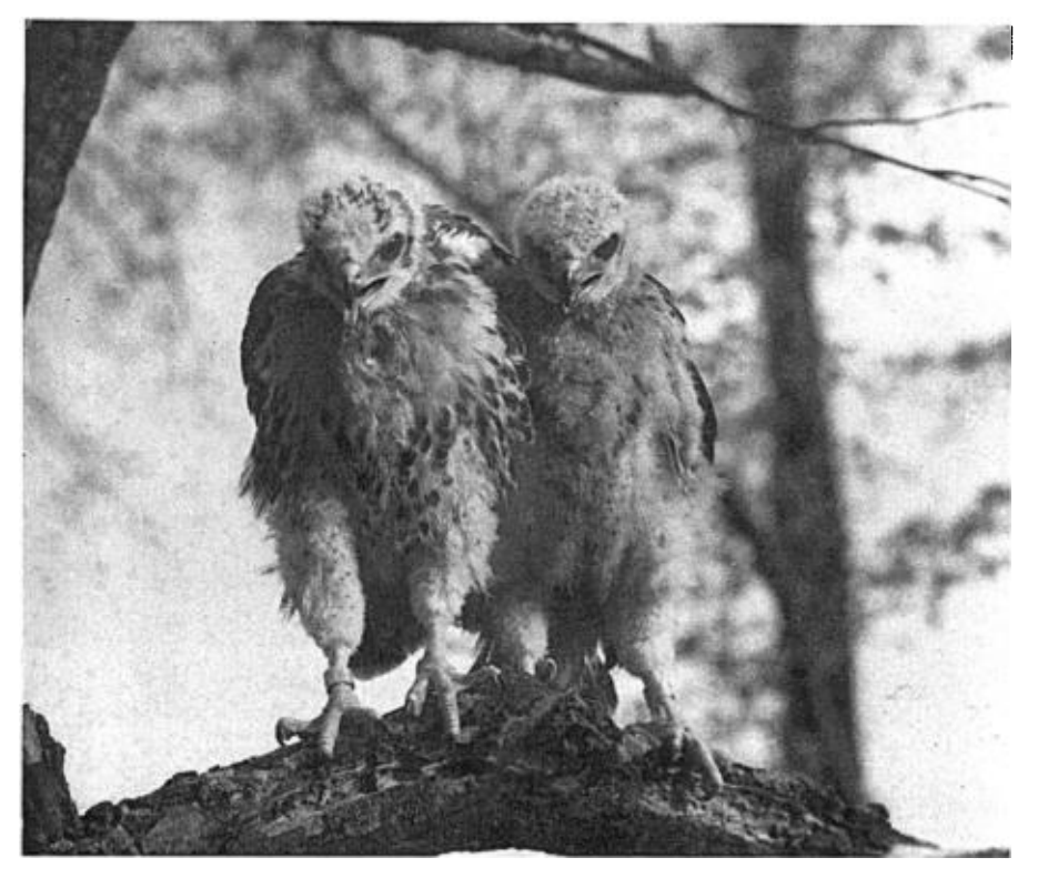
Fig. 5. Young Red-tailed Hawks nearly ready to leave the nest. At this age they begin to jump from the nest at the approach of the climber.

Birds were reluctant to leave the cover of their roosting woods and after being flushed several times they doubled back, often quite close to us. Birds of a pair generally roosted in the same woodlot and by early January the shift to the nesting area, if any, had been made. Similarly, Errington (1932b) found that all but one of 29 pairs moved into their nesting areas in late fall and Baumgartner (1938) stated that the nesting site is selected several months before the eggs are laid.