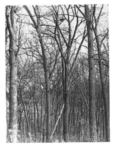
Fig. 4a. Red-tailed Hawk nest in a red oak ( Quercus borealis ) on the edge of dense woods.

Plumage variations.—The Red-tailed Hawk is noted for its wide variety of plumages, particularly in the western portion of its range. On our study area no extremely