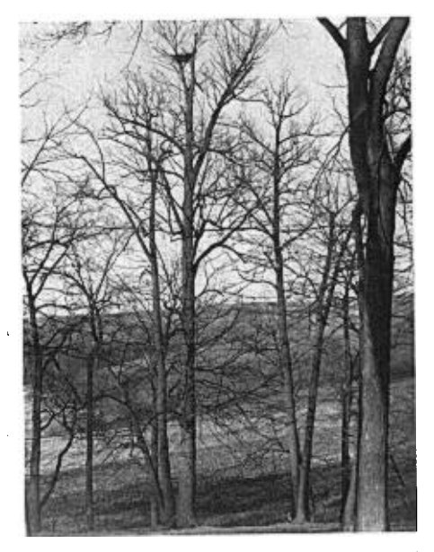
Fig. 4b. Red-tailed Hawk nest in a basswood ( Tilia americana ) on the edge of an open, heavily grazed woodlot.

white individuals have been observed, but we saw black individuals on ten occasions in the autumn, winter, and early spring. The only immature black bird observed closely was recorded in the company of a "normal" adult on March 28, 1953.