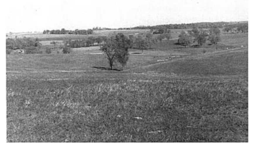
Fig. 1. Typical scene on study area showing small woodlots, scattered trees along a stream, and cropland.

Of considerable interest was the scarcity of immature Red-tails in the winter. From November 30, 1953, to February 15, 1954, we observed 39 adults and 10 immature