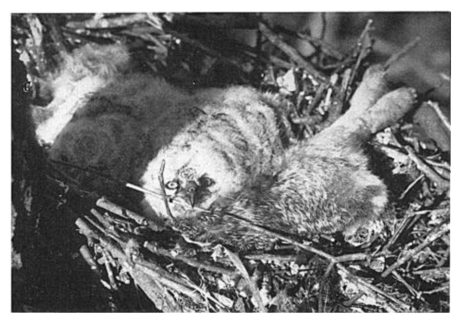
Fig. 6. Young Horned Owls in nest with remains of an adult cottontail, their principal food on the study area.

from 13 birds banded, all at points 13 to 20 miles from the banding location. We found one adult which had died of a virus infection (Animal Disease Diagnostic Laboratory, University of Wisconsin). The symptoms were similar to those of a dead bird found by Errington (1932a), but unfortunately specific determination of the virus was not possible. Golden Eagles sometimes kill owls in the western states (Dixon, 1937; Carnie, 1954) but we know of no important predator of adult owls in Wisconsin.