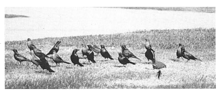
Fig. 2. Brewer Blackbirds gathered about a dummy of a Brown Towhee which has been blown over by the wind. The flock is about to depart.

Brown Towhee Dummy.—The posture of this dummy was similar to that of the female blackbird dummy, but its head was horizontal instead of pointing slightly up-