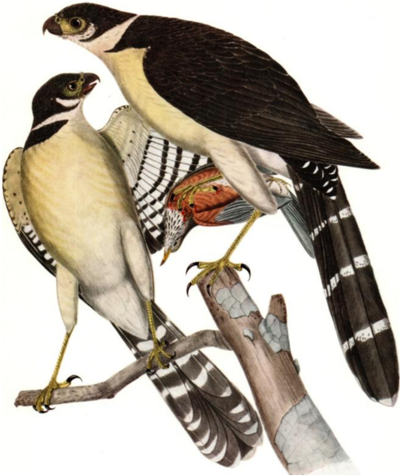
COLLARED MICRASTUR MICRASTUR SEMITORQUATUS Two-fifths natural size Painting by Andrew Jackson Grayson