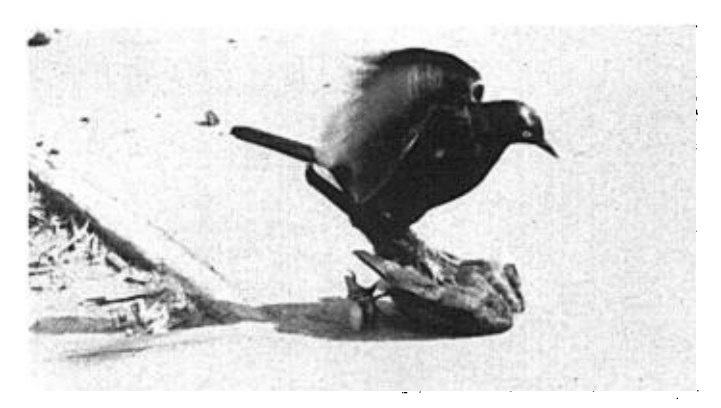
Fig. 2. Male Brewer Blackbird copulating with headless female dummy.

Similar results were obtained with other birds, but once an abortive attempt at copulation was made.