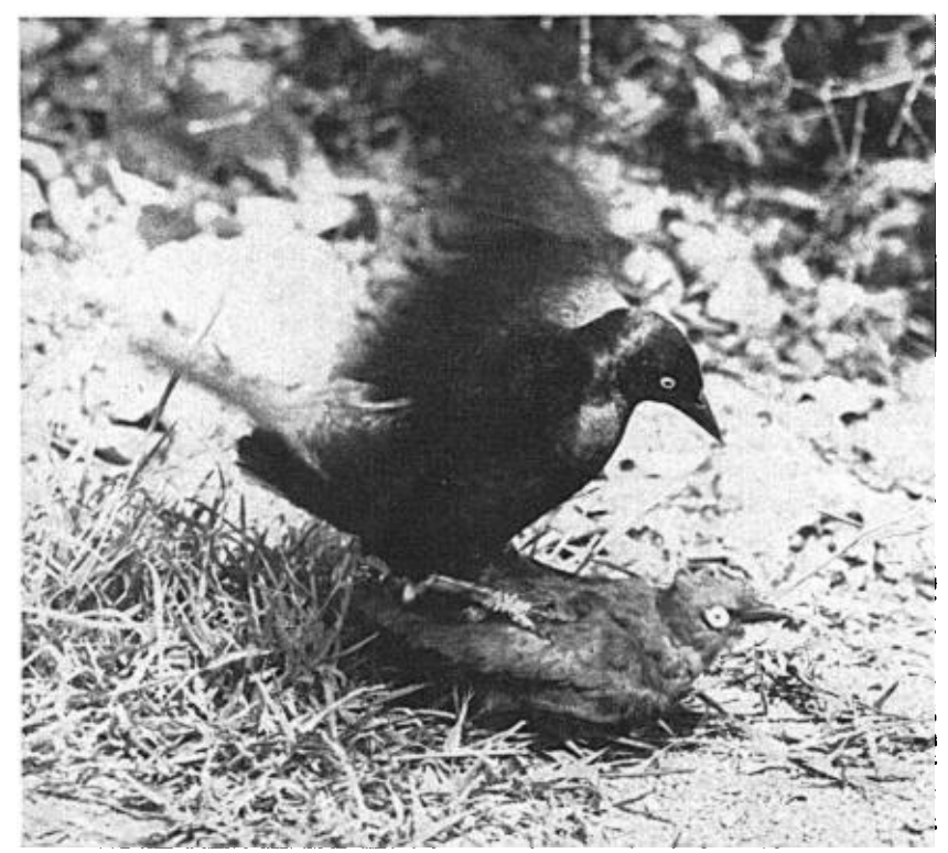
Fig. 4. Male Brewer Blackbird copulating with yellow-eyed female dummy.

lone male in flight swooped down over the dummy, hovered for a moment, and flew off. Then, after five minutes, the male of a pair in flight at least 75 feet away swerved and headed for the dummy; the female followed. The male alighted directly on the back of the dummy, started to copulate, looked down and seemed suddenly disturbed, hopped into the air, and thereby knocked over the dummy. He looked at it from the side and gave it an aggressive peck on the head. His mate had meanwhile remained about six feet behind, chattering. Two other pairs flew up and hovered above the fallen dummy, chattering. Another male then flew to the dummy from behind, alighted on the ground, walked to it, and mounted. Almost as soon as he got on he hopped off to one side, looked at it, mounted, and dismounted again. Then he walked to the right front of the dummy, seemed about to display, but did not. Again he quickly mounted and dismounted, gave the start of a display, and then nervously snatched a crumb and flew to a nearby perch. None of the copulations was completed.