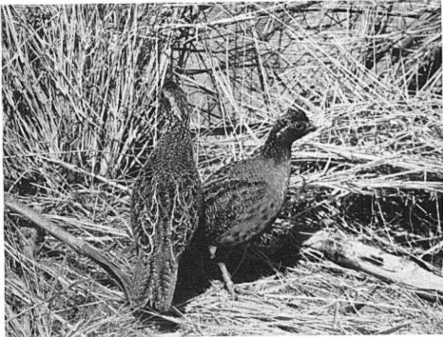
Fig. 1. A pair of Masked Bobwhite.