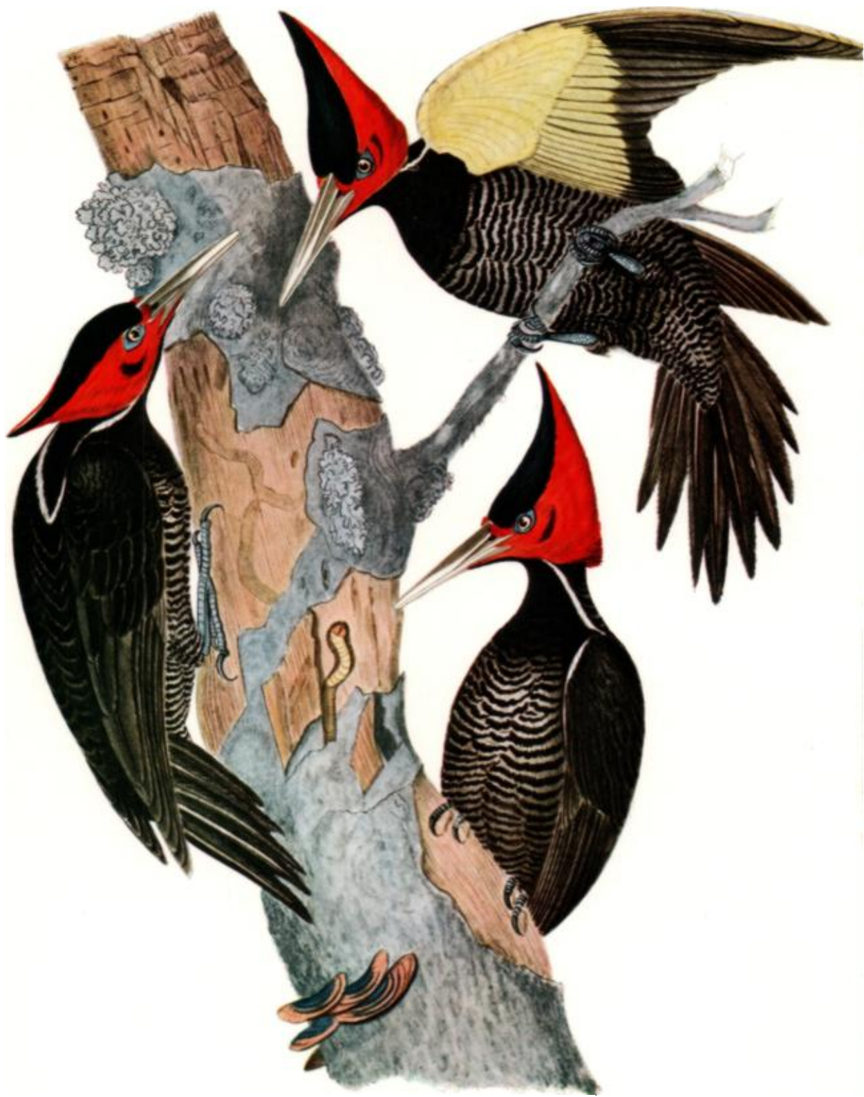
GUATEMALAN IVORY-BILLED WOODPECKER