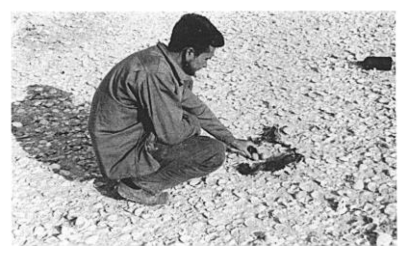
Fig. 33. Nest of the Pied Oyster-catcher, Shell Island, partly protected from wind by a piece of dried gut of a green turtle.

On April 20 I carried out quite a thorough search for eggs on Shell Island (fig. 32). This island is a low sand and shell ( Pecten circularis ) spit approximately three-quarters