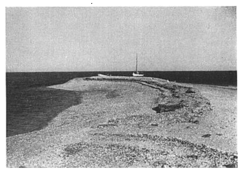
Fig. 32. Sand and shell spit, Shell Island, Scammon Lagoon, showing type of beach used by nesting oyster-catchers of this area.

Scammon Lagoon supports the largest population of oyster-catchers of any of the