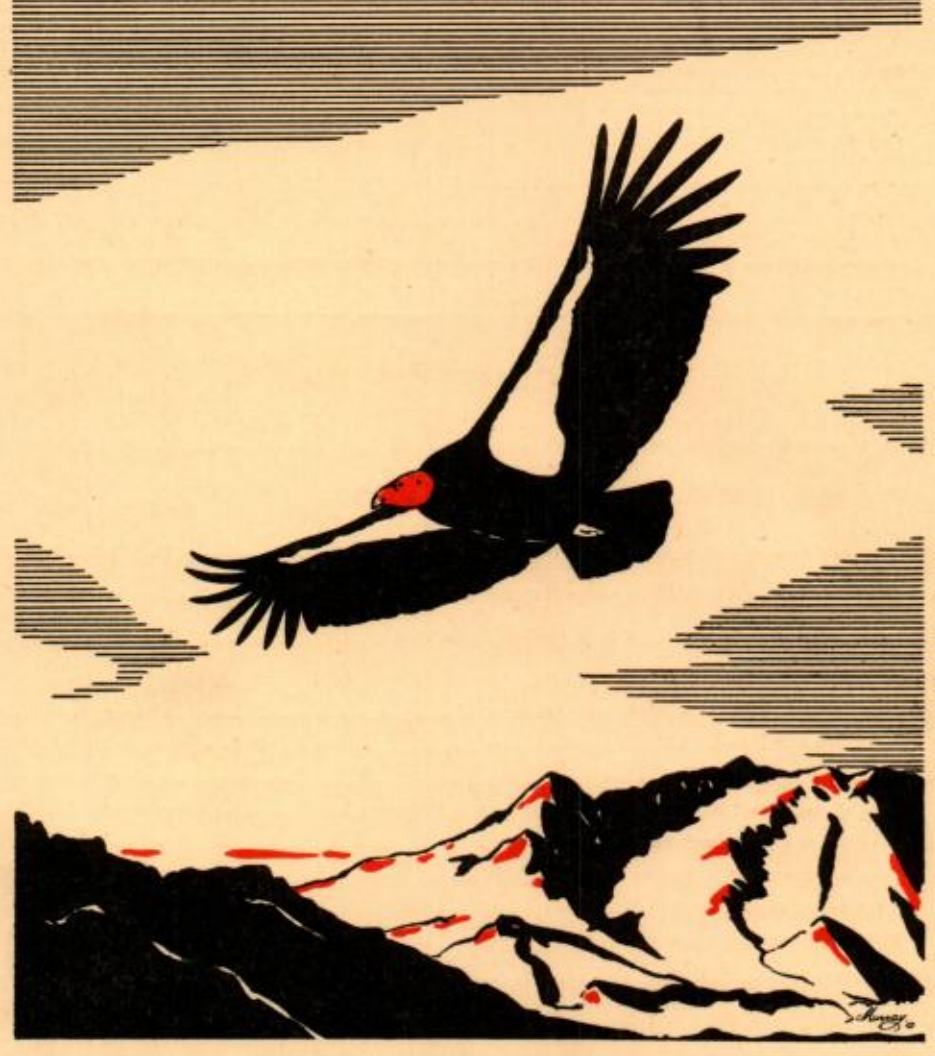
JOURNAL OF THE COOPER ORNITHOLOGICAL CLUB