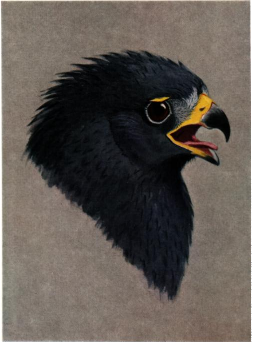
ZONE-TAILED HAWK Painting by Allan Brooks