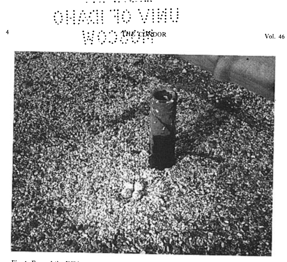
Fig. 1. Eggs of the Killdeer on roof of California State Exposition Building, Exposition Park, Los Angeles; May 21, 1942.

A question that comes quickly to mind is, How do the young Killdeers reach the ground? Or it might better be expressed, How many of the young ever reach the ground in safety? Mr. Bilderback states that the distance from the edge of the roof of the California State Exposition Building to the lawn below is 42 feet. The rain-water drains can be of no aid, because their upper ends are screened and their lower ends discharge directly into the sewer. The only youngsters to survive a fall to the ground are probably those whose descent is broken by shrubbery or other soft vegetation. Old employees of the building, who say that the birds have nested on the roof "for a number of years," have more than once liberated chicks from light wells in front of basement windows, into which they had tumbled. Those that were thus assisted were quickly taken in charge by their parents; and a downy young was observed by Mr. Bilderback in 1942 in the company of an adult in the Exposition Park rose garden near the building. There is no direct evidence, however, that any of these chicks were hatched on the roof.