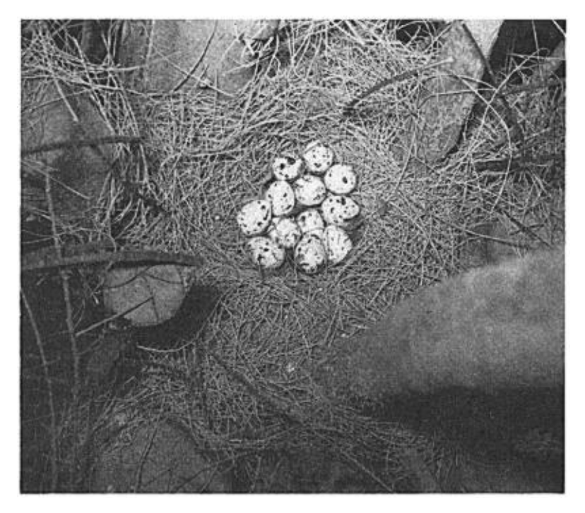
Fig. 32. Quail nest in tree shown in figure 31.

Another nest in the Glynn Stannard grove was seen by the writer; this one was in a grapefruit tree between eight and nine feet from the ground in an abandoned thrasher's nest; 14 eggs had hatched safely. Another nest was built in vines over a porch but apparently was deserted, and since the vines were thick no inspection was made.