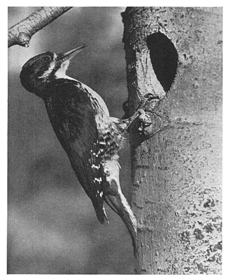
Fig. 68. Male Arctic Three-toed Woodpecker at nest at Gold Lake, California.

male had two grubs held crosswise far back in his bill; the rest of the time the grubs were held lengthwise. Although the total number of visits to the nest was about evenly divided between male and female, it was apparent that they were not always in rotation but rather that there were three or four visits by one parent, then three or four by the other with occasional alternate visits.