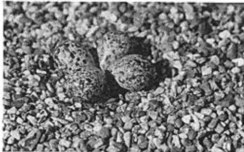
Fig. 38. Second set laid by Killdeer on gravel roof of storehouse at Benicia Arsenal.

The building was about two hundred yards from the shore of the Carquinez Straits. The location was favorable to the birds, at least in that it was out of reach of prowling mammals.—EMERSON A. STONER, Benicia, California, August 24, 1936.