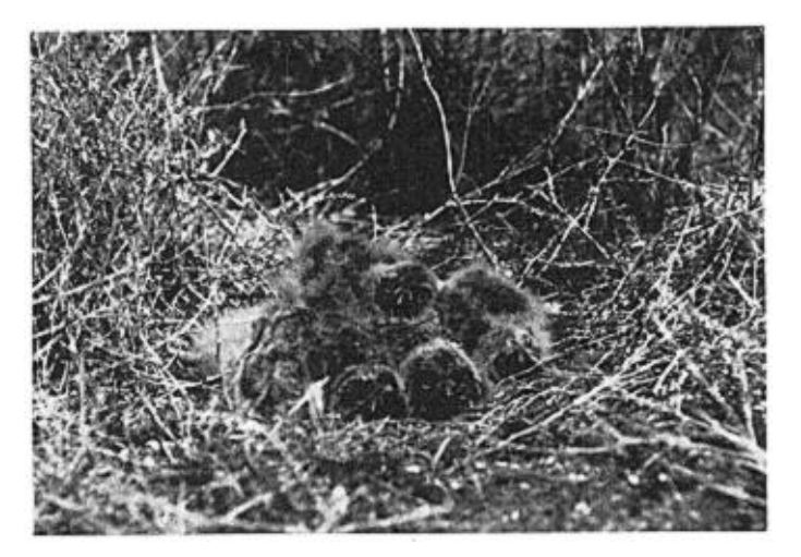
Fig. 29. Four young Short-eared Owls in their nest on open ground below the high cliff of the so-called "peninsula" area.

were obtained on the food of this species, though one nest contained part of a blacktailed jack rabbit. Another nest investigated on the lava beds contained, at different times, meadow mice, a kangaroo rat, and a Washington cottontail. The food of the Barn Owls, however, was abundantly evident. The meadow mouse ( Microtus mon tanus ) must represent well over 90 per cent of it. It is possible, on the strip of ground along the bases of the cliffs, of which perhaps an acre may be said to be practically paved with rodent bones, to find the remains of a good many northern California kangaroo rats, and occasionally white-footed mice, wood rats, pocket gophers ( Tho momys ), jack rabbits and cottontail rabbits. Lower jaws of meadow mice could have been collected by the wheelbarrow load.