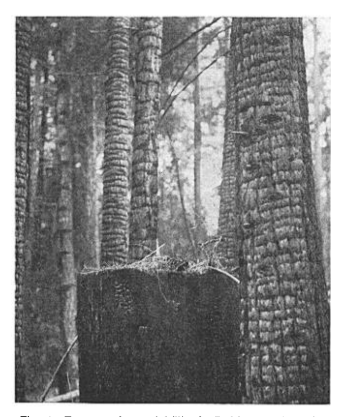
Fig. 10. Exaggerated case of drilling by Red-breasted Sapsuckers, showing workings on all members of a family of stump sprouts. Drillings extended from near ground line to the upper crowns.

It might be deduced that the sapsucker is highly selective in choosing trees, or, put in a better way perhaps, it is only the rare redwood tree that is attractive to the sapsucker. In the case of a clump of stump sprouts, each sprout seems to possess this attractiveness or palatability. Were a record available of the parent tree, it is not unlikely that it, too, would have been found to have been a host for the sapsucker. This relationship between parent tree and sprouts is manifested also in other ways.