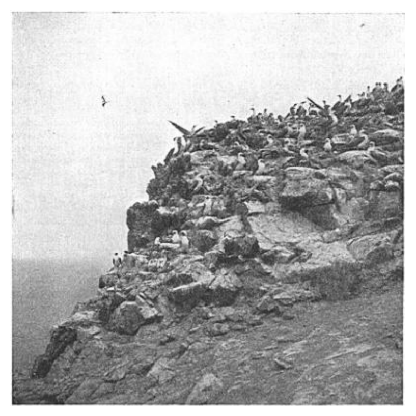
Fig. 3. Nesting colony of Piqueros, South Ballestas Island.

lation, no trace of which now remains. The substantial buildings of the guano administration give the impression that this is the most important of the islands, strategically, if not also commercially. The abundance of birds is inconceivable. From estimates made by Dr. Forbes of England in 1913, no less than 5,600,000 cormorants occupied Central Chinchas, less than four square miles in area. One thousand tons of fish a day would be necessary to feed such a multitude.