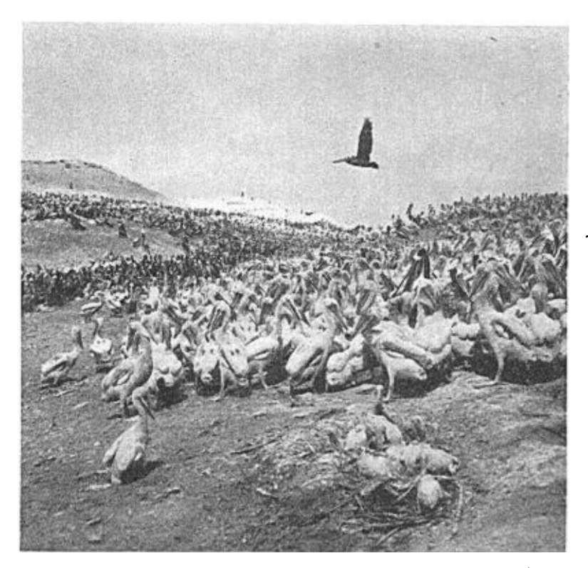
Fig. 5. Part of a colony of 40,000 pelicans on Lobos de Afuera Island.

to produce large, compact colonies rather than small, scattered ones. The ceaseless warfare now waged against gulls undoubtedly involves innocent migrants as well as guilty indigenes. The practical extermination of the vulture and the condor (although the latter is a harpie from the Andes likely to swoop down at any time) from several of the islands has brought about the more expensive disposal of the bodies of dead birds by cremation. Finally, the role of predators in the control of bird disease, as far as I am able to ascertain, is yet undetermined.