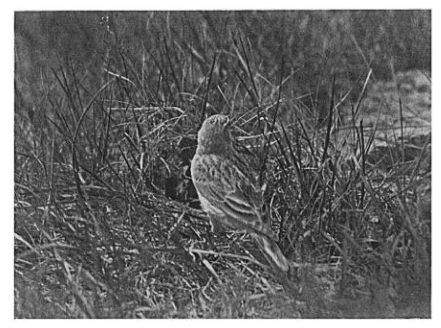
Fig. 12. Desert Horned Lark attending young in nest number 8; photographed on May 21, 1915.