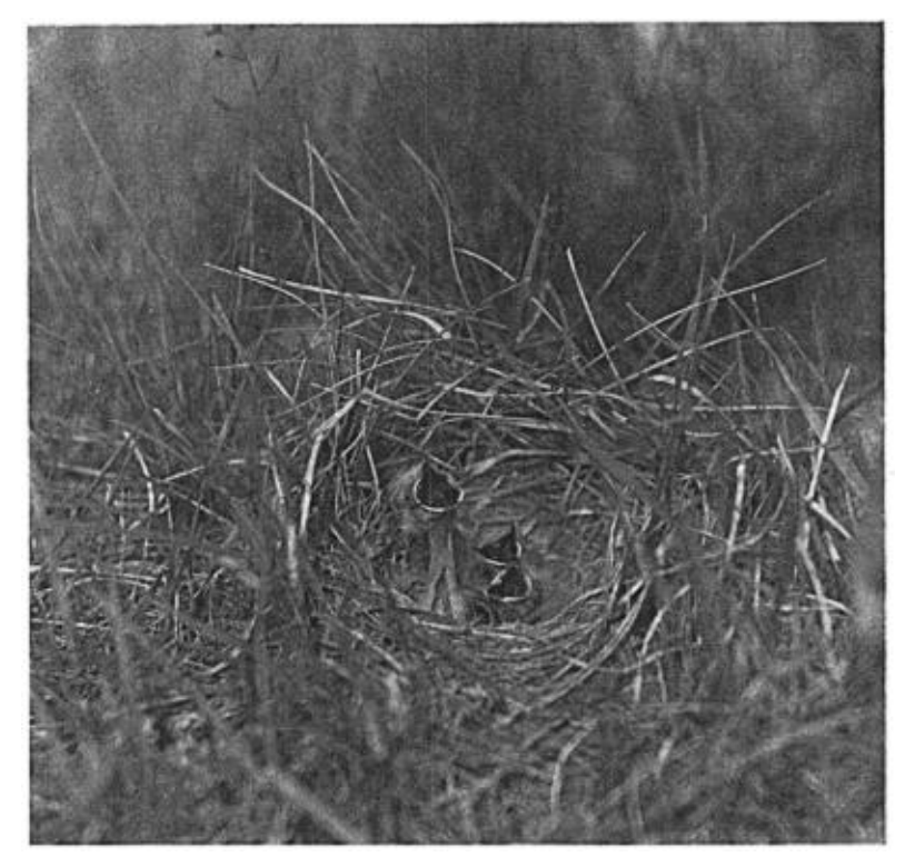
Fig. 10. Desert Horned Lark nestlings four days old, on May 21, 1915, in nest number 8.

From this stage on, development is surprisingly rapid. The skin, above, is blackish; but at the age of one day the upper surface of the nestling seems covered with the curious long, buffy down. At two days the rapid growth has become especially noticeable. The eyes may begin to open. The long, dead-grass-colored down, though it grows only on certain tracts in decided bunches, appears to cover the whole body of the young bird as it squats in the nest. When three days old the skin has become noticeably blacker and some "pins" are beginning to appear. The nestlings stretch