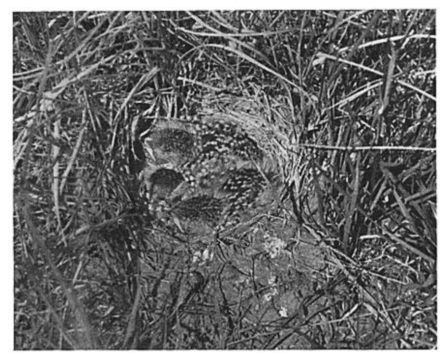
Fig. 11. Desert Horned Lark nestlings seven days old, on June 21, 1915, in nest number 20.