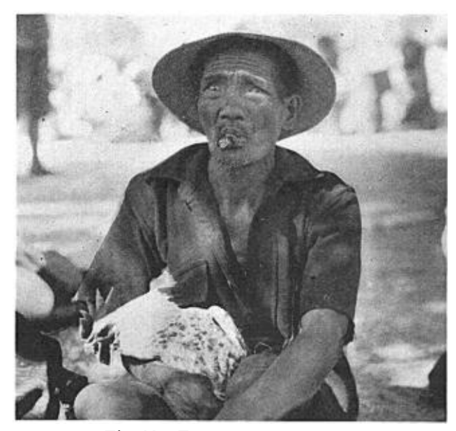
Fig. 88. THE LIGHT OF HIS LIFE.

Wherever one goes in the Philippine Islands he will see the bare-footed and ragged Filipino with his pet cock (fig. 88) under his arm or squatted by the road-side or by his miserable nipe shack, training it in the essentials of fighting. This cock is his most beloved possession, the hope of his financial prosperity, the object of his unfailing devotion. Cock fighting is the national sport around which is centered the life of the community, while the cock pit is the communal gathering place. The performance of the cock in the terrifying commotion of the pit, his undaunted courage, and his response to training are so remarkable that they warrant a brief comment in these pages.