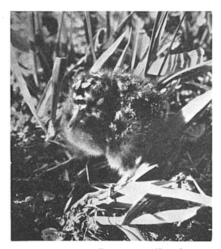
Fig. 64. Downy young of Wilson Snipe. Nome, June, 1921.

In the spring of 1922, at Wainwright, but two were seen, one on June 26 and the other on July 3. They were fairly common at Wales during the spring and summer, the first arrivals being noted offshore on May 29. After that date a few were seen almost daily, but they seemed scarce in comparison with the great number of the former species. A few sets of their eggs were found; their nesting habits were very similar to those of the Red Phalarope.