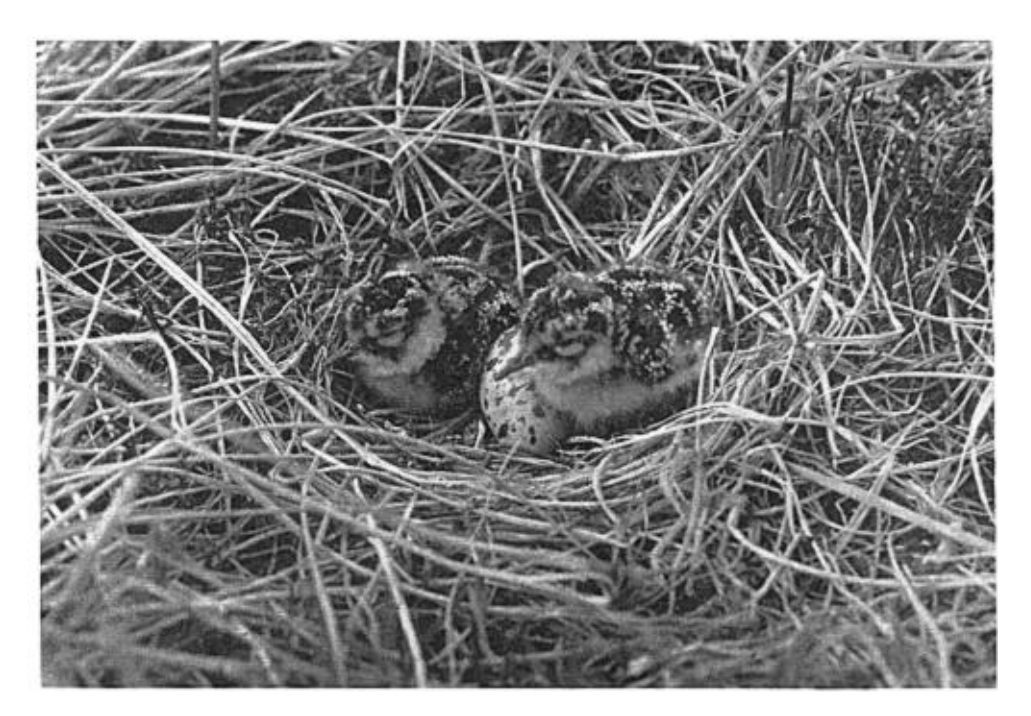
Fig. 65. Downy young of Aleutian Sandpiper. Emma Harbor, Siberia, July 4, 1921.

The next year I found the Aleutian Sandpiper an abundant nesting bird at Wales, which extends the known breeding range almost to the Arctic Circle. They made their first appearance on May 28, and by the end of the month were common upon the rocky slopes of the high tundra along Wales Mountain. At this time they appeared in small flocks but by June 10 they were paired and preparing to nest. On June 14 I found my first nest by flushing the female from underfoot. The nest was on top of a ridge at an elevation of about 500 feet, in moss, and no effort had been made to conceal the contents. There were but three eggs in the nest, but the fourth