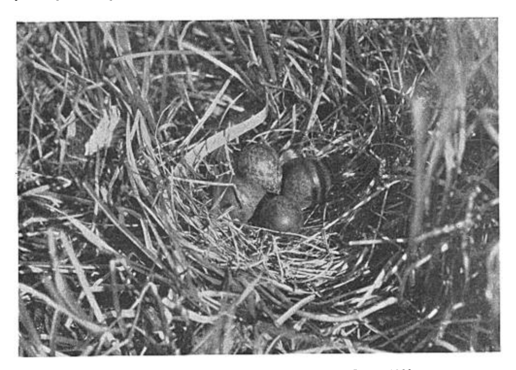
Fig. 63. Eggs of Red Phalarope. Wales, June, 1922.

This was the most abundant of the shore birds at Wales, as at Wainwright. The bulk of the species arrives soon after the first newcomer; I did not note these phalaropes until June 1, and on the fifth they were common. They are to be found