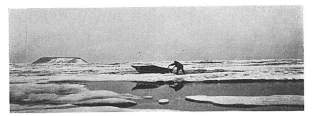
Fig. 32. SLEDGE ISLAND AND BERING SEA FROM THE BEACH AT SYNUK VILLAGE, ALASKA, JUNE 3, 1915. THE PROCESSIONAL SPRING MIGRATION OF THE KING EIDER WAS OVER A ZONE BETWEEN THE ISLAND AND THE SHORE. THE ISLAND IS ALMOST DUE SOUTH FROM THE VILLAGE.

Other flocks of the ducks and of geese of the fall migration, that I observed at Synuk, including the Mallard and the Canada Goose, approached the