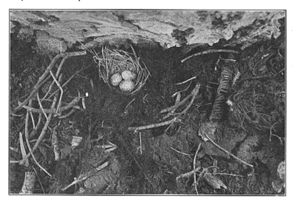
Fig. 3. NEST AND EGGS OF TOWNSEND SOLITAIRE; V149/3-16.

snow. I set to work in good earnest examining the bases, and had accomplished nothing in an hour's work, so sat down on a rock for a cold bite of lunch, determined to see if I could get any lead. I did see a bird flit about 75 yards up the hill, but it disappeared against, or behind, a tree bole and I saw nothing more of it. These birds have a marvelous way of slipping around unobserved. The next I knew a male was singing overhead 125 feet up. By and by I had the rare pleasure of seeing and hearing the ecstatic song flight of the male. From a height well above the treetops and 300 feet above the earth, he descended, slowly, in a great spiral, with fluttering wings. More than ever he looked like a Mockingbird, except that his action did not savor of the grotesque. The song torrent was light and sprightly in character, reminding me more of the breathless rhapsody of the Lark Sparrow than of the measured accents of the Thrush. This