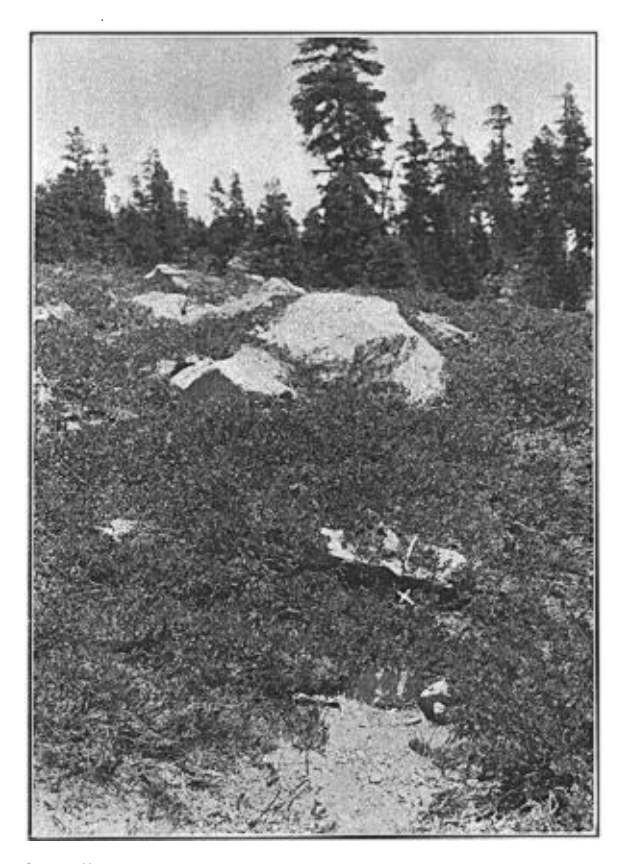
Fig. 5. NESTING SITE IN DWARF MANZANITA. LOCA-TION OF NEST 218/4-16 IS INDICATED BY WHITE X.

Mr. Vrooman was particularly successful in finding old nests, as well as