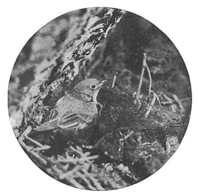
Fig. 4. TOWNSEND SOLITAIRE ON NEST AT BASE OF SHASTA FIR.

V150/3-16 Townsend Solitaire; alt. 7500; July 19, 1916: Bert had made the location six days ago, Thursday, July 13, but the nest at that time had no lining,