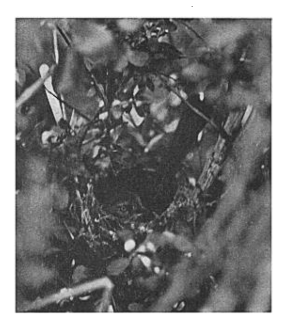
Fig. 28. Wren-tit on its nest

When visited at 7:30 A. M. March 25, the nest was completed and neither bird was in evidence. It was a rather deep cup-shaped nest, compactly but lightly built, and laced, for its principal support, 21 inches from the ground, to the side of a perpendicular stalk of teasel coming up through the clump of baccharis, a few smaller twigs serving to steady it. The materials used in its construction were weed and bark fibers and dried grass, with a thin inner lining of dried grass and horse hair. The following measurements were made after the young had left and when the nest was slightly distorted and otherwise rather the worse for wear: Outside, depth 2.75 inches, diameter 3 inches; inside, depth 2 inches, diameter 2.90 inches.