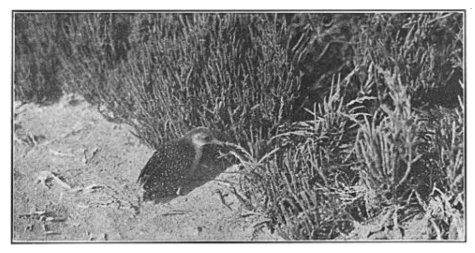
Fig. 25. A FARALLON RAIL IN ITS SALT MARSH HOME; PHOTOGRAPH OF A CAPTIVE

it over, inch by inch. This is accomplished by a careful swing of the foot. which at first is exceedingly tiring, but which grows comparatively easy as practice makes it a mechanical action. One thing is interesting as a side light on this bird's shyness, a habit that is a constant aggravation to the collector. This is the astonishing ease with which the birds bring themselves to abandon incomplete sets when they are discovered. Although I have found several incomplete sets, I have in no instance succeeded in collecting a full set from the nest at a later date. In every case the bird had deserted when I went back. Of course, with the method of search employed, one is bound to kick into some of the nests and disturb the surrounding marsh weed before discovering them. That a naturally retiring bird should desert under these conditions is, of course, not surprising. On at least two occasions, however, I have found nests containing incomplete sets by a lucky glimpse of the eggs through an opening in the protecting growth above them, while I was still at a considerable distance from them. In these cases, I have turned aside without apparently notic-