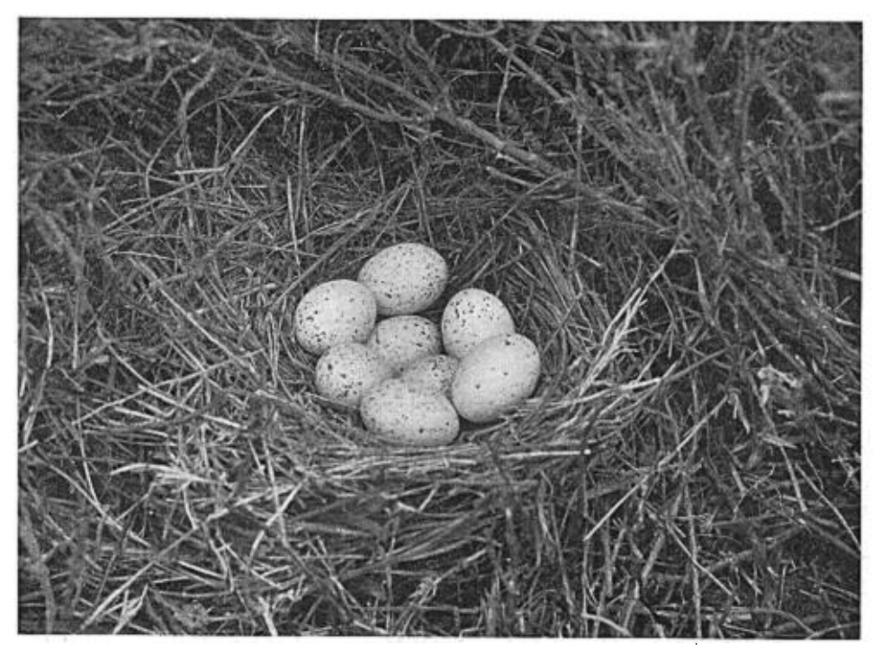
Fig. 23. NEST AND EGGS OF THE FARALION RAIL: THE PRIZE, HIDDEN AWAY IN A DENSE SALICORNIA CLUMP

I have spent hours and even days on the Rail marshes at all times of the year, and find that even as early as February, on clear mornings, the clee-cle clee'-ee (accent falling on first syllable of last word) may be heard in many places on the marsh. This is particularly true when one has walked about the