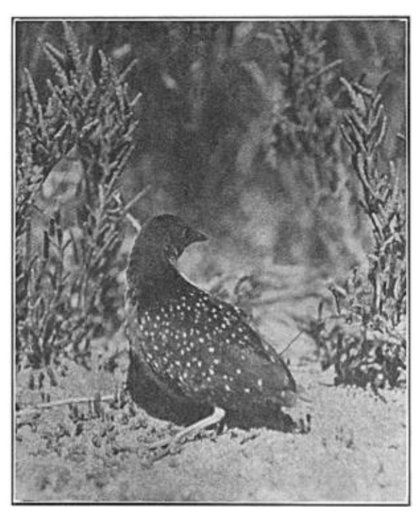
Fig. 24. Farallon Rail, photographed in captivity: undecided whether to crouch and hide, or to dive into the dense marsh vegetation

three times on account of recent rains and high tides. The latest date which I have encountered was May 25, 1909. On that day I started on a last casual "hike" through the marsh with nothing more than that undving hope, born in all bird hunters, to offset my slim chance of finding anything so late in the Suddenly, howspring. ever, I flushed a Farallon Rail, and after careful search I found a well elevated nest. some ten inches above the ground, which contained four partly incubated eggs at that time. These eggs are the smallest which I have ever seen, tending, in fact, to be almost runts. They measure, respectively, .87x.69, .94x.74, .95x.72, .95x.73, with an average